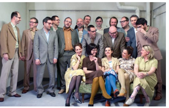
(Klangforum Wien)