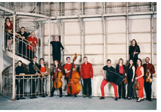
(Ensemble Reconsil Wien / Photo © Maria Frodl)