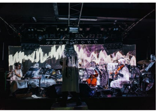
(Black Page Orchestra)