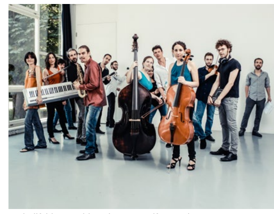
(Schallfeld Ensemble)