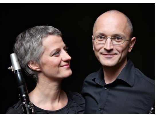
(Duo Stump-Linshalm / Photo © Viktor Brázdil)