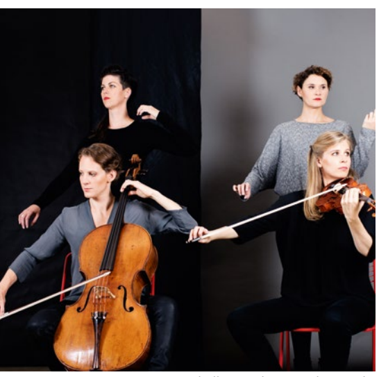
(Vierhalbiert / Photo © Julia Wesely)